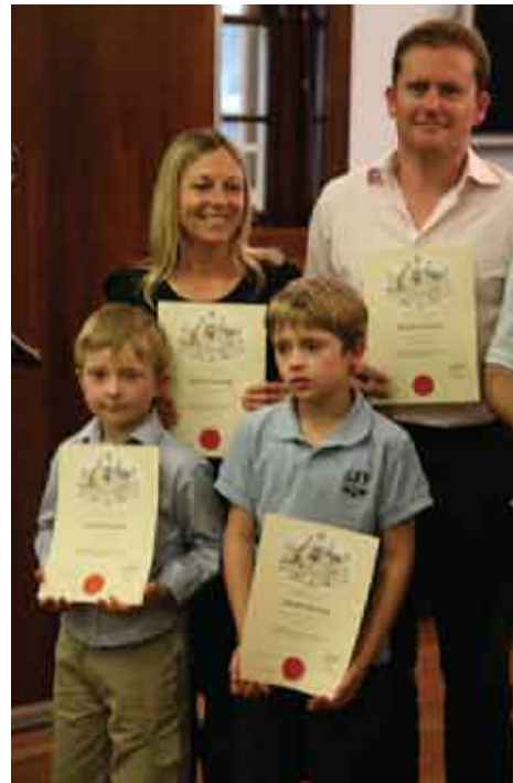
Becoming Australian citizens

At the ceremony you will be asked to make the Pledge of Commitment as a Citizen of the Commonwealth of Australia, usually called the Australian Citizenship Pledge.