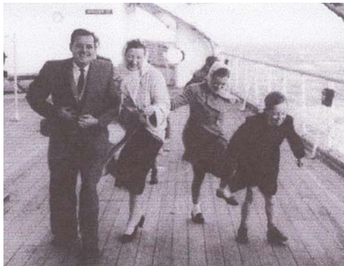
The artist with her family aboard SS Orsova, 1958