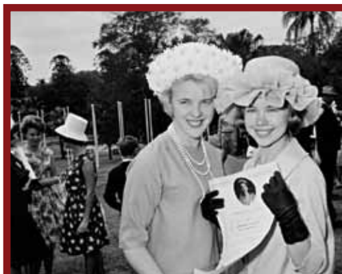
Ceremony at the Brisbane Botanical Gardens 1964

To maintain the dignity and propriety of the occasion, private commercial activities (for example sale of souvenirs) should not be associated with citizenship ceremonies.