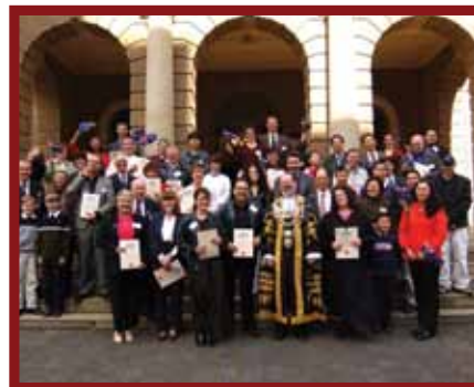
Australian Citizenship Day 2001 ceremony, Hobart Town Hall

Community organisations may also conduct citizenship ceremonies, usually on or near significant days such as Australia Day, Australian Citizenship Day and significant national anniversaries. Community organisations may be asked to sign an agreement with the department on how ceremonies are to be conducted.