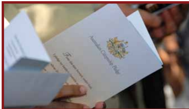
The Pledge of Commitment must be made by candidates at their citizenship ceremony.

The version of the pledge which each candidate wishes to make is specified on the Australian citizenship pledge verification list forwarded to local government councils by the department. Pledge cards may be placed on the candidates' seats or handed to candidates on arrival. Children under 16 years of age are not required to make the pledge but may do so.