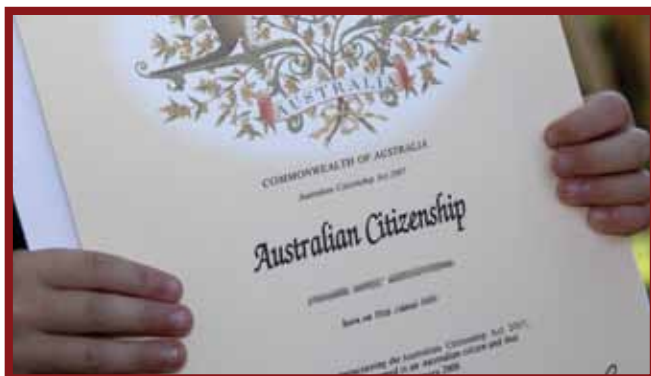
An Australian citizenship certificate

Children in this situation do not acquire Australian citizenship (even if they make the pledge or their other parent is present) and should not be provided with Australian citizenship certificates. They should be advised to take the matter up with an office of the department as soon as possible.