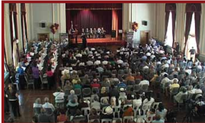
Citizenship ceremony at Albert Hall Canberra 2008

It is not appropriate for a citizenship ceremony to be held at a venue for the purpose of promoting a commercial enterprise.