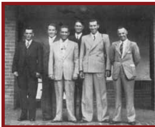
First new Australian citizens following the inaugural naturalisation ceremony held at Albert Hall in Canberra on 3 February 1949.

These requirements are described in more detail in Chapter 9.