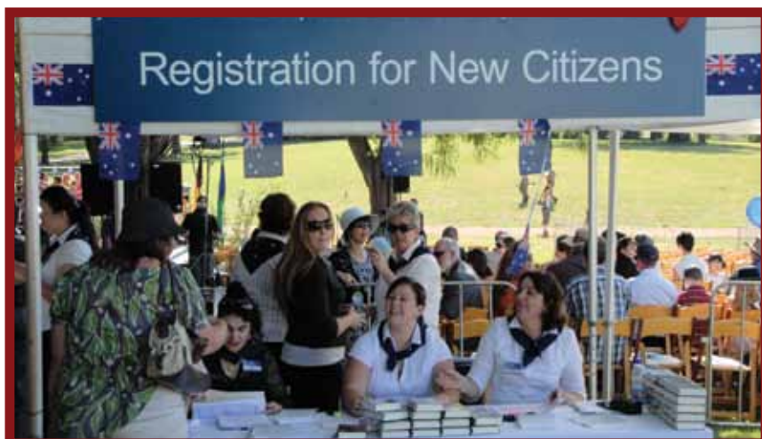
Registration desk for new citizens at the Australia Day 2008 citizenship ceremony, Commonwealth Park, Canberra